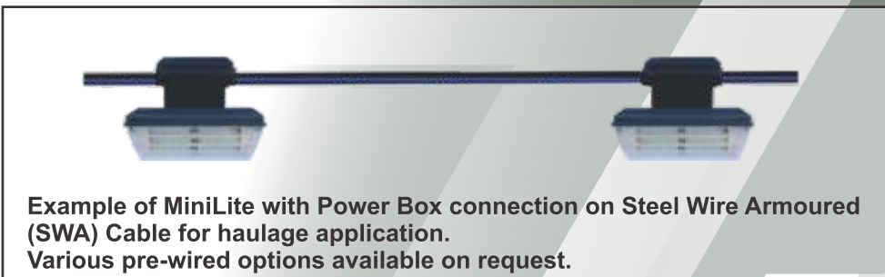
Example of MiniLite with Power Box connection on Steel Wire Armoured (SWA) Cable for haulage application. Various pre-wired options available on request.