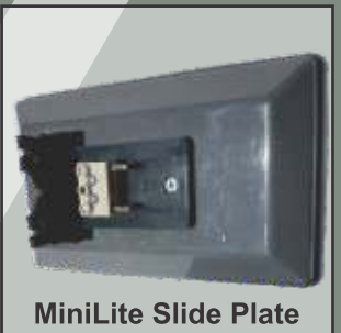
MiniLite Slide Plate