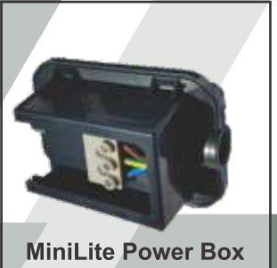
MiniLite Power Box