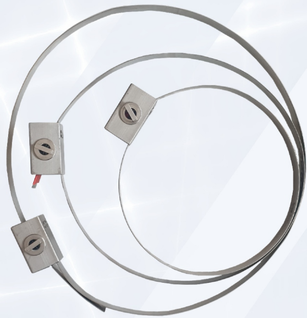
Patent No: 2020/02751 Design No: 2019/00810